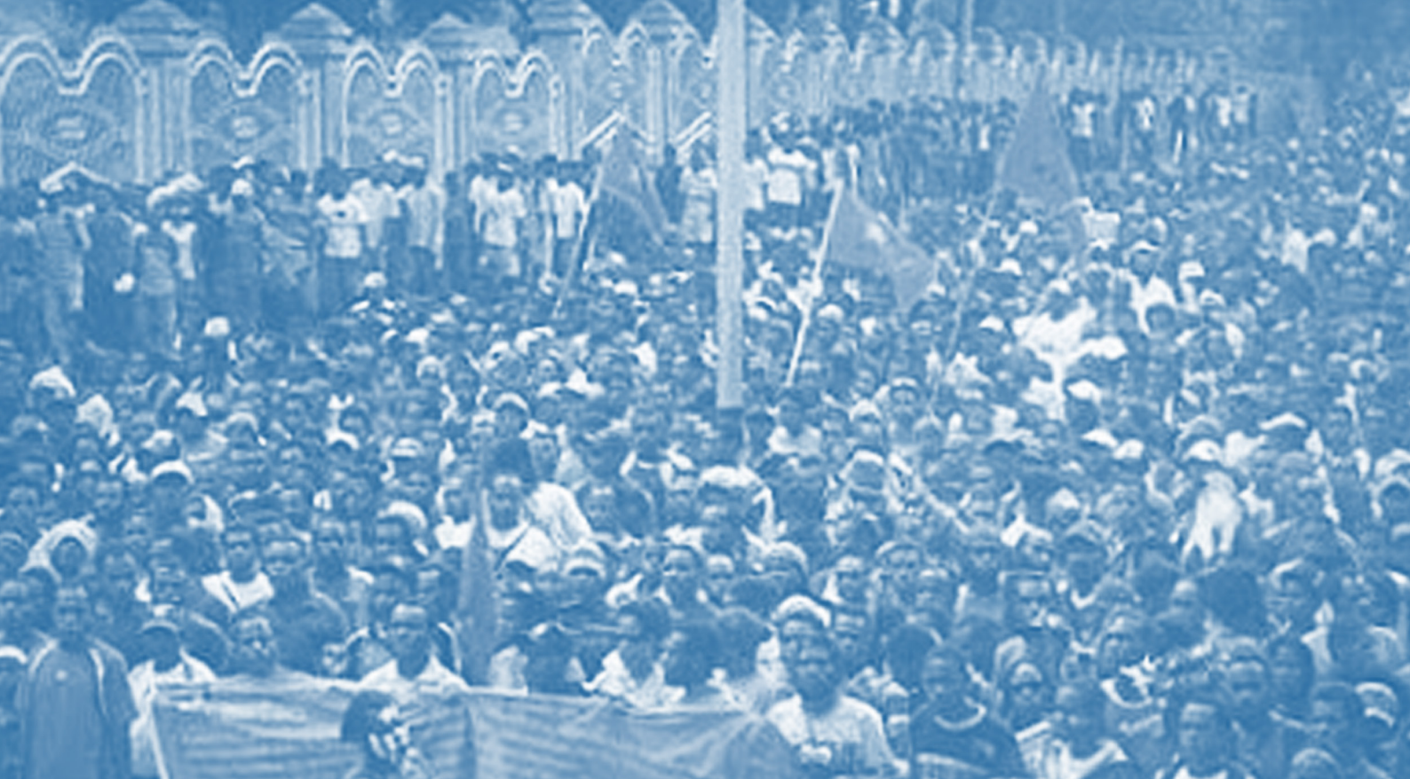
KNPB's demonstration in Jayapura.