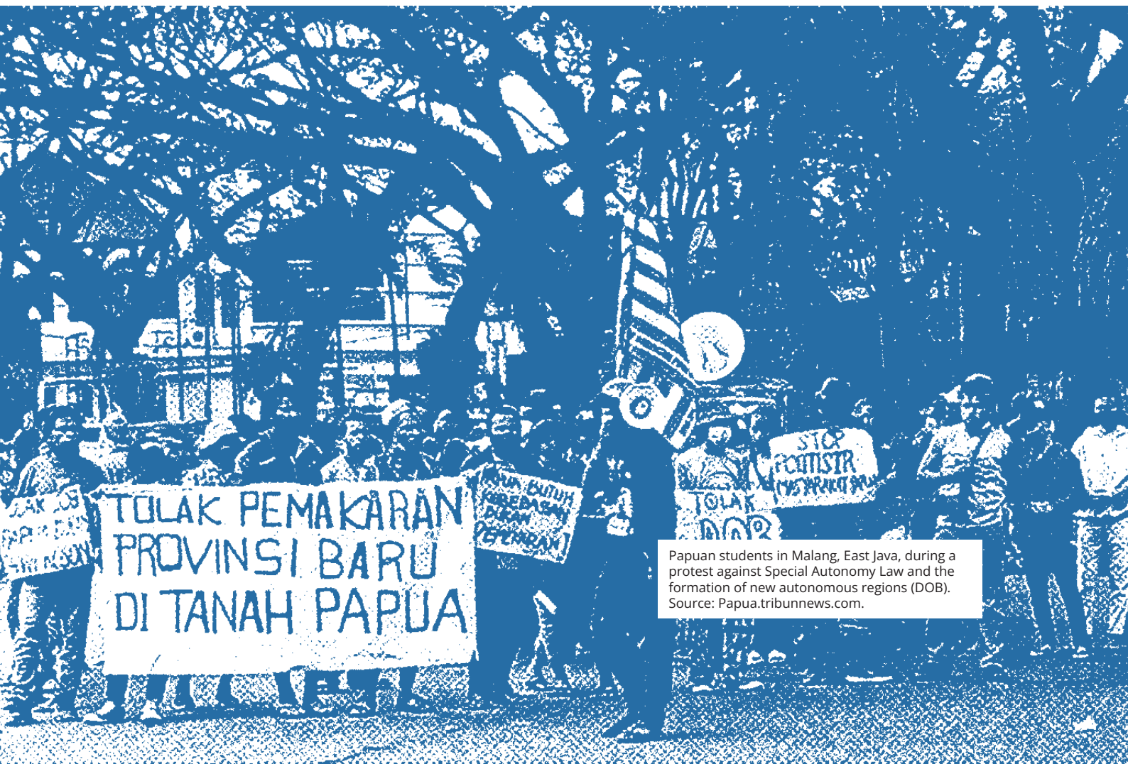
Papuan students in Malang, East Java, during a protest against Special Autonomy Law and the formation of new autonomous regions (DOB).

for the latest information on West Papuan political prisoners.