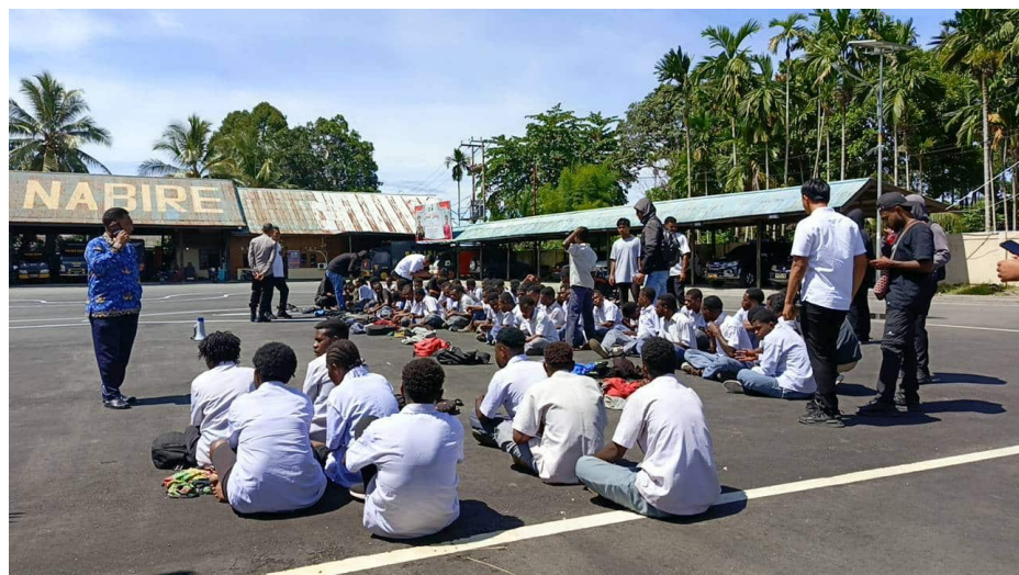
Image 3. Dozens of high school students at Nabire police headquarters, Nabire district, Papua Tengah province, after their demonstration against the Free Nutritious Meal programme was dispersed, 17 February 2025.

There were 78 new arrests between January and March 2024. In this period we documented 50 new cases involving arbitrary arrest against Papuan youth (aged between 15 and 17). Almost all of them were high school student protesters in Nabire, Papua Tengah Province, who were arrested on 17 February for protesting against the MBG Programme. The high school students in Nabire named their coalition Solidaritas Pelajar West Papua (SPWP, or Solidarity of West Papuan School Students). The protesters gathered in a local market in Nabire city and started to march to the local Education Ministry Office to raise their concern that some media had reported many cases where students had become sick from the MBG and they demanded that the MBG should be changed to a free school programme. After marching less than a kilometer, the students were intercepted by the Nabire Police Force and 48 of them were arrested and brought to the Nabire Police Headquarters (Mapolres). The police claimed that the protest was provoked by KNPB ( Komite Nasional Papua Barat or National Committee for West Papua). 9 After being interrogated, all the students were released without charges.