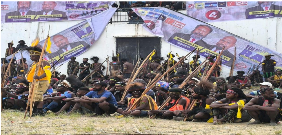
Image 2. A campaign rally for regent and deputy regent candidate pairs in Tolikara Regency, Papua Pegunungan Province, November 2024.

In mid-February, the Constitutional Court ruled that some of the local elections in West Papua should be reheld, including for the whole of the Papua province, after the Court dismissed the winning Vice Governor there for administrative fraud. In March, the local Election Commission (KPU Provinsi Papua) announced that the local elections would take place on 6 August 2025. 6 During the campaign for the election in Papua Province's Governor there have been reports of hate speech and some candidates are reported to have made inflammatory speeches that have caused inter-Papua ethnic and religious tensions. 7