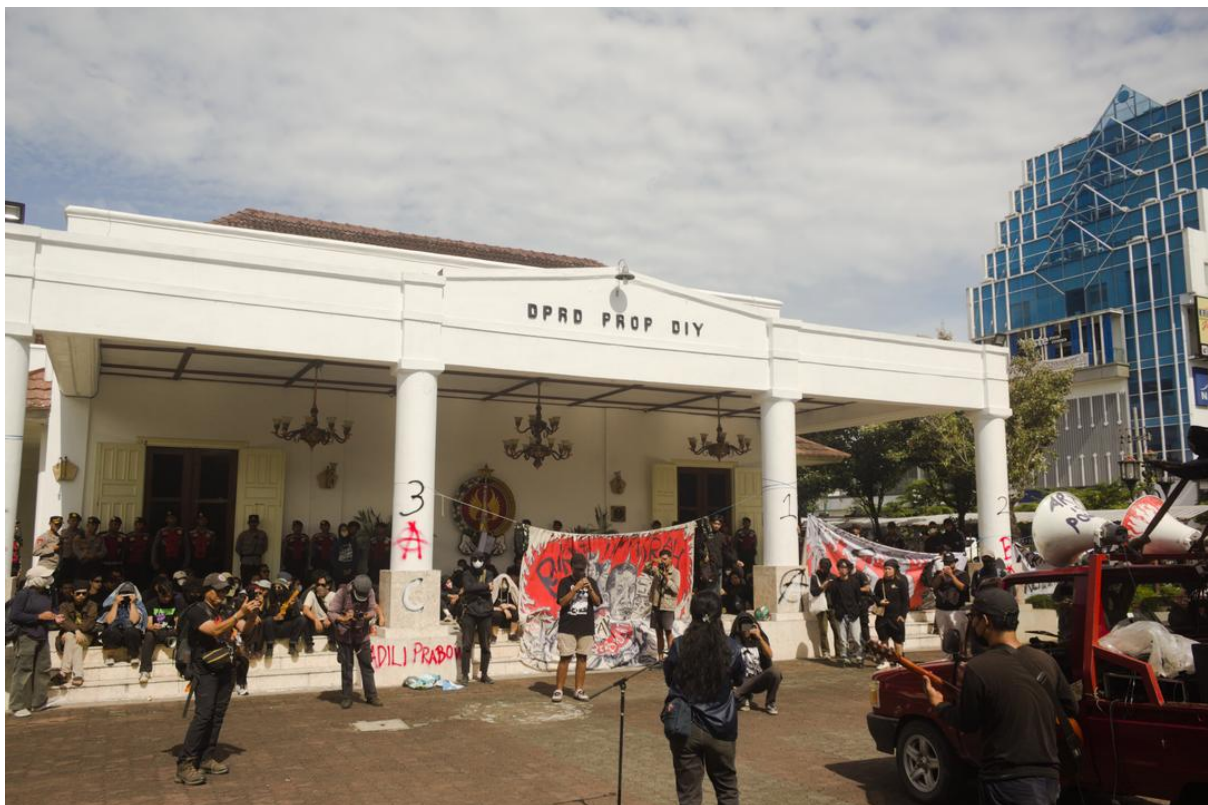
Image 1. The demonstration against the revision of the TNI Law in front of the Yogyakarta Provincial House of Representatives building.

On 20 March, the national Parliament (DPR RI) passed an amendment to the 2004 Military (TNI) Law, despite facing nationwide mass protests from university students and other civil society groups. The amendment provides a bigger social and political role for the military, beyond their traditional role in defence. Under the new Military Law, active military personnel can be appointed to 14 additional official posts, including some in law enforcement. Unfortunately, the changes to the law did not follow up on efforts to reform the military justice system, and this has prevented public courts from prosecuting military personnel who commit criminal offences, thus perpetuating impunity. A proposal to allow military personnel to enter business sectors was rejected due to the large public protests nationally.